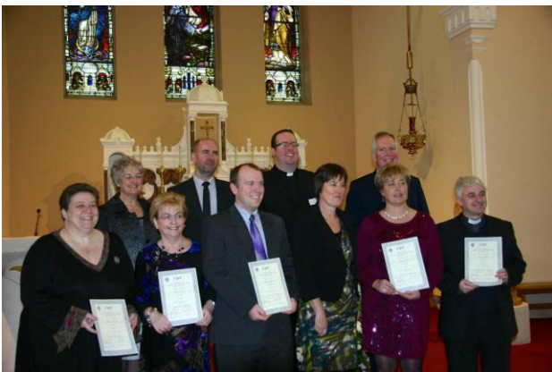
A happy group at Ballyclare.

Congratulations to the six chaplains who completed the most recent CPE unit and received their certificates at a special graduation service on 7th December. This is the seventh unit facilitated by NIHCA.