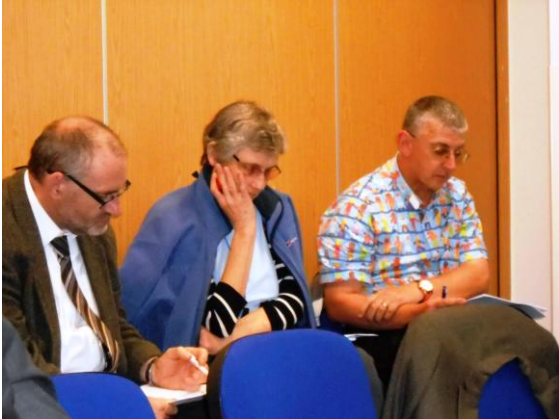
Does an AGM need such concentration?